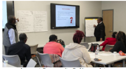
A recent Community Café on safety.

Parents and other community members in the 63106 and 63107 ZIP codes are joining in Community Cafés to develop and pursue solutions to major concerns in their high-need neighborhoods. The Community Café is a structured process related to the Parent Cafés which have been held in the LAUNCH area for several years. While the Parent Café focuses on parent peer support, the Community Café is directed to making the community a better place for children