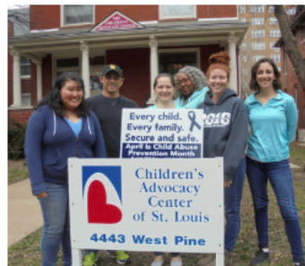
Children's Advocacy Center staff members display their sign at their Central West End location.

During April, the St. Louis Child Abuse & Neglect Network has been working to strengthen families and prevent abuse and neglect by promoting Child Abuse Prevention Month. "Every Child, Every Family, Secure and Safe" yard sign are being posted around the area. See photos of signs plus prevention information on the Vision for Children at Risk Facebook page . Your organization can be part of the Healthy Family Festival on Saturday, May 12, from 11 a.m. to 2 p.m. at the Deaconess Center for Child Well-Being, 1000 N. Vandeventer. Learn more .