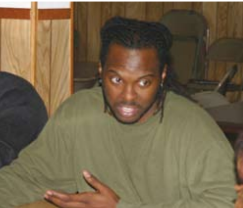
Photos of Mapping a Course Participants