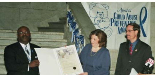
The St. Louis Family & Community Partnership celebrates April Blue Ribbon Month to prevent child abuse.

● Public Education. Vision for Children at Risk provided a forum for civil, constructive dialogue through community forums attended by hundreds. A steering committee comprised of diverse stakeholders met regularly to advance the next steps for community collaboration. Briefing sessions were held for state legislators and a commentary article was published